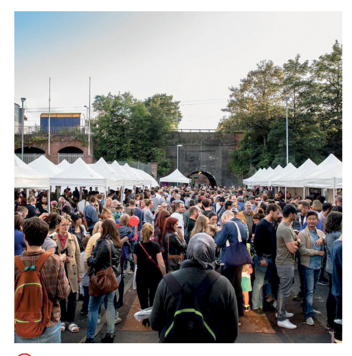
Levenshulme market, started to encourage shopping locally to build community. Supported by University of Manchester.

The mark adds further recognition to our social impact work. In 2013 we became the first UK University to be called a 'Changemaker Campus' by Ashoka U, joining universities and colleges around the world recognised as global leaders in social innovation.